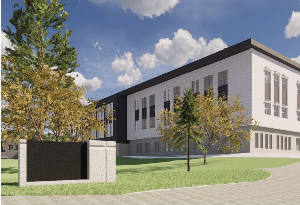
MILWAUKIE HIGH SCHOOL