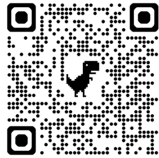
QR code for Jan 14 PC hearing page