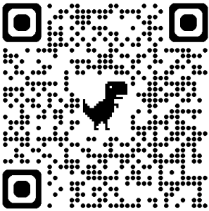
QR code for April 22 PC hearing page

The City of Milwaukie is committed to providing equal access to information and public meetings per the Americans with Disabilities Act (ADA). If you need special accommodations, please call 503-786-7600 at least 48 hours prior to the meeting.